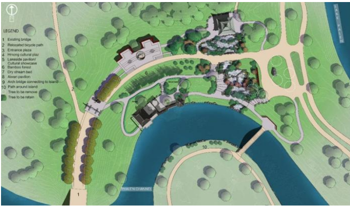
This general map of Phalen Park shows the area where the garden will be built. (submitted illustration)