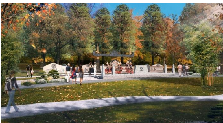
An important element within the garden is the Hmong Cultural Plaza to emphasize Changsha as the ancestral home to many Hmong in Ramsey County. (submitted illustration)