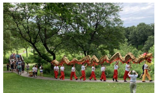
Center & Right: A group of Hmong Qeej players led the procession to the Archway, followed by the Chinese Lion Dancers