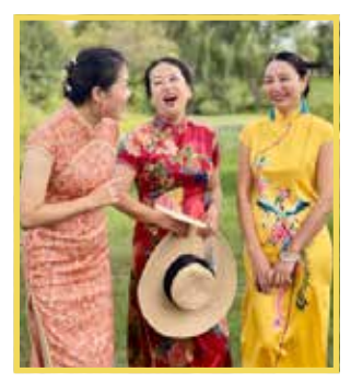
Chinese qipao models.