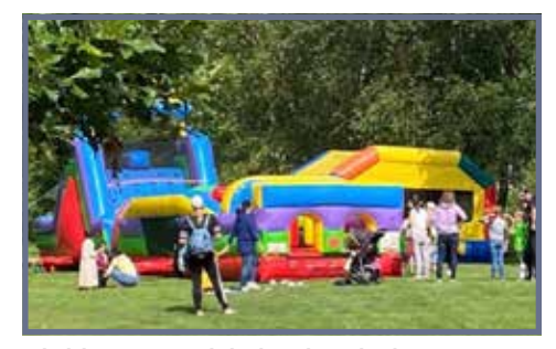
Children were delighted with the inflatable playground