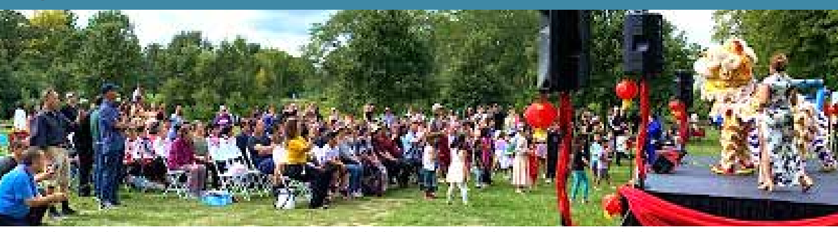
People enjoyed the stage on Picnic Island so much there is a budding movement to have a permanent one built!

If Mid-Autumn Festival is the penultimate family event in China, we here in Minnesota showed the world we also know how to build community guangxi under the full moon!